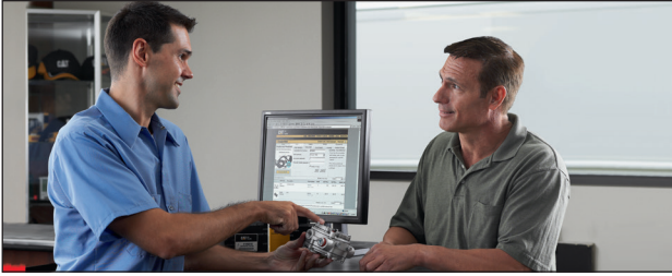
Local service and support