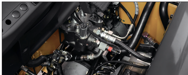
Factory warranty for added protection