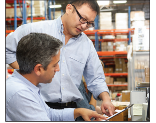
Custom financing packages