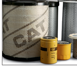
Genuine OEM parts