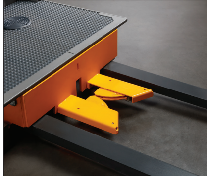
Simplified pallet retention on the EKS 414s