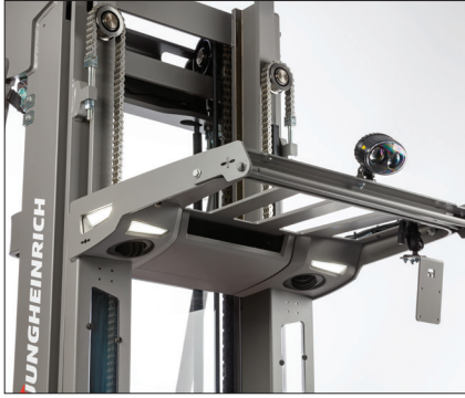
Visibility to high loads