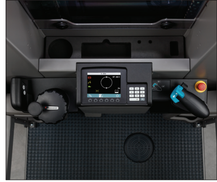
Ergonomic operator compartment