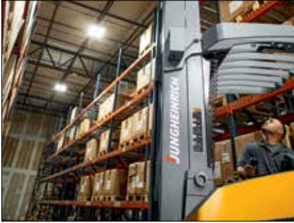
Overhead guard visibility