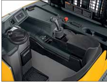
Multifunction control handle

Performance profiling allows you to customize the reach truck's drive and hydraulic settings based on your application, individual operator experience level and personal preferences. All display-based programming, performance and information requests can be performed with easily-accessible buttons.