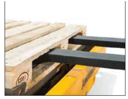
Rear loading of trolleys is easy with