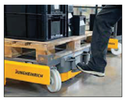
Unlocking with the foot clamp