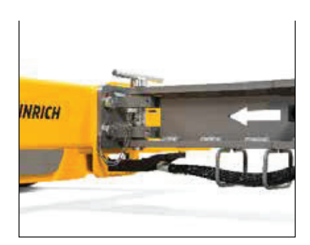
Electrical connection for trailers (GTE 312)